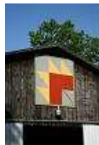
No. 17 Maple Leaf - Late Fall